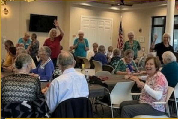
A GOOD TIME WAS HAD BY ALL & THANKS TO EVERYONE FOR THEIR SUPPORT! WE HOPE TO SEE YOU ALL AT FUTURE SC EVENTS.