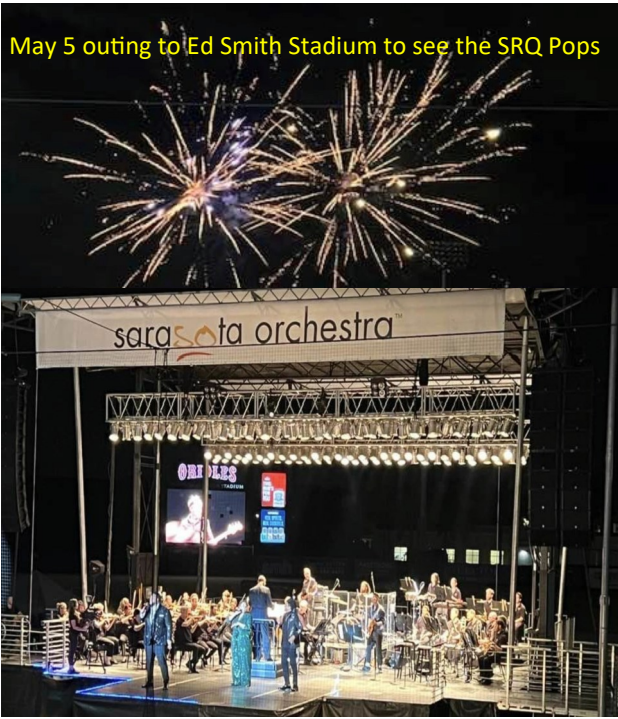
May 5 outing to Ed Smith Stadium to see the SRQ Pops